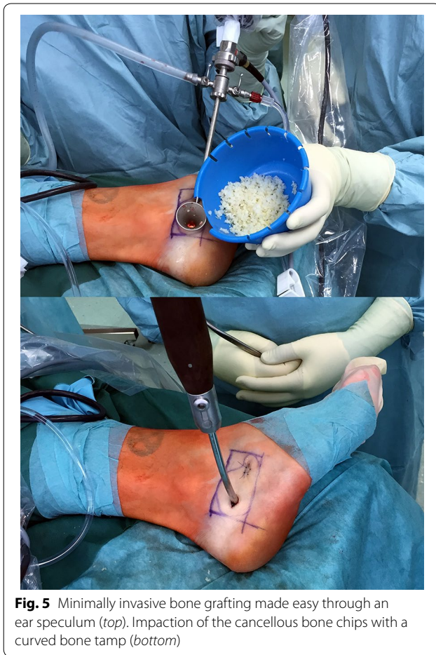
Fig. 5 Minimally invasive bone grafting made easy through an ear speculum ( top ). Impaction of the cancellous bone chips with a curved bone tamp ( bottom )