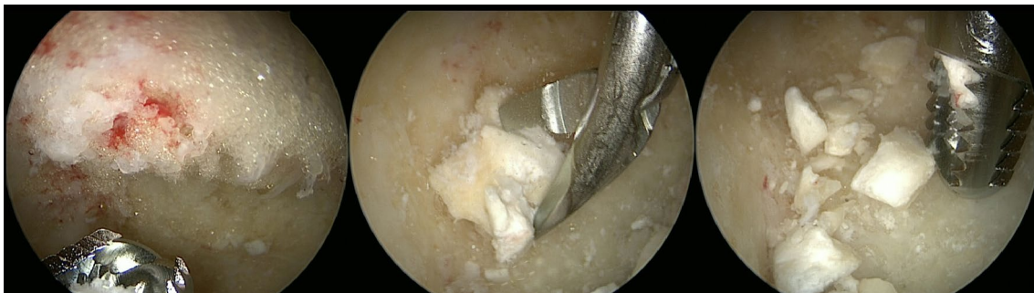
Fig. 4 After the introduction of the scope into the bone cavity, vision is often impaired by fat tissue in the case of intra-osseous lipoma. After irrigation and endoscopic removal of the fat tissue with an arthroscopic shaver (left), residual calcifications can be identified and removed with an arthroscopic grasper or shaver (middle and right)