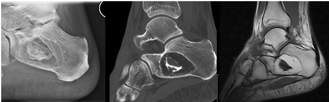
Fig. 1 Typical radiographic appearance of calcaneal lipoma of bone: plain radiography (left), sagittal CT-scan (center) and T1-weighted sagittal MRI (right) show an osteolytic lesion with central calcifications surrounded by fat-intense soft-tissue

The type of intervention for unicameral bone cysts remains controversial (Levy et al. 2015). General treatment options for UBC include curettage in combination with autologous or allogenic grafting, the use of bone substitutes, autologous bone-marrow injection