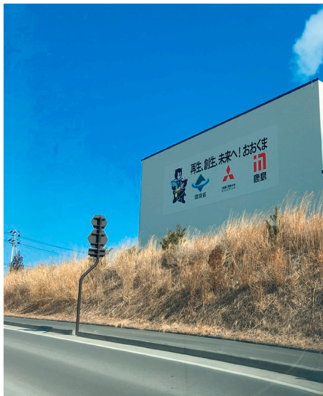
The new incineration plant in Ōkuma town inside the evacuation zone.