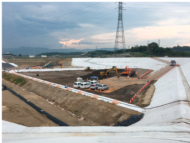
Construction work on a facility for containment of radioactive soil. Okuma-Machi, Fukushima. Photo: Miranda Schreurs, 30 August 2018.

The question of what to do with the huge amounts of radioactive water that has been stored in the thousands of tanks that now fill the grounds of the Fukushima Dai-ichi nuclear facility grounds also needs to be addressed. 15