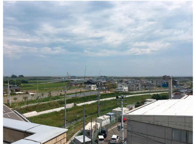
Rebuilding Shinchi-Machi as a new energy town. 30 August 2018.

The city is also integrating renewable energy into construction design. NIES [30] runs research projects in the town aimed at understanding how to best develop a model of not only renewable energy integration, but also societal integration through internet-based communication technologies. 10 In addition, an industrial park is being built that is to derive its energy from a thermal power plant supplied by an LNG terminal [31].