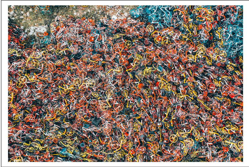
Figure 4. A pile of shared bikes in Shanghai.

Second, public experiments today almost inevitably raise questions about responsible governance. Attempts at ‘disruptive’ or ‘transformative’ innovation increasingly work within, or even purposefully create, zones of legal ambiguity and exception that may become institutionalized and permanent. Uber, Facebook, Google, and others continue to insist that existing laws, regulations, and norms on such issues as employment, privacy or freedom of speech do not apply to them because their innovative products and services operate in unprecedented legal territory. Living labs often purposefully lower regulatory burdens to experience the effects of novel technologies in real life ‘as if’ these technologies had already been proven safe and effective (Engels et al., 2019; Laurent, 2016; Laurent et al., 2021). Experiments in development economics enroll people in large-scale experiments with unclear answers to questions of consent, risk or benefit sharing. In all cases, innovators and policymakers tend to see existing regulations and norms as a hinderance to scaling. Scalability thinking thus fits in a highly problematic framing that sees innovation as the ‘driver’ of change and regulation ‘lagging’ behind (Hurlbut et al., 2020; Jasanoff, 2011; Pfothenhauer and Juhl, 2017). A critical analysis of the politics of scaling must broaden the space of reflection about how innovation and regulation can relate to each other beyond such one-dimensional framings.