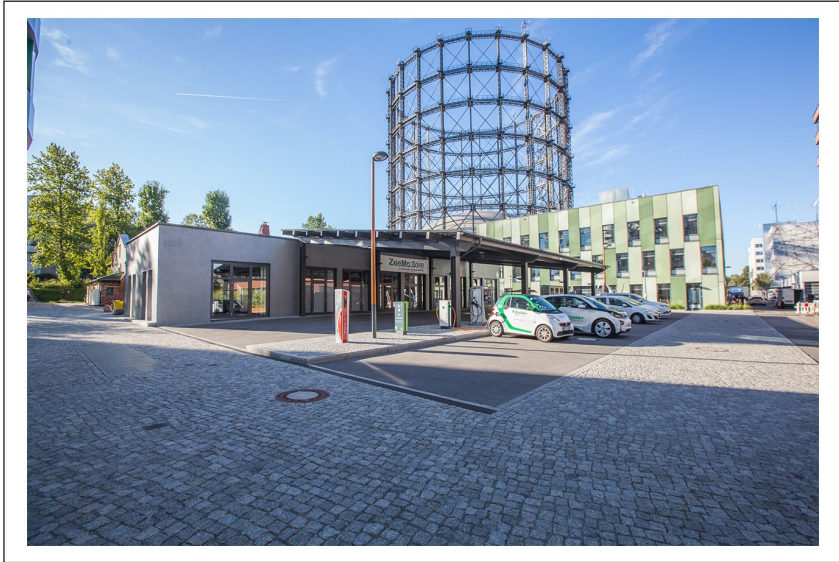
Figure 3. View of the European Energy Forum (EUREF) campus in Berlin, a ‘living lab’ for energy transitions and new digital and mobility technologies aimed at broader urban (and global) transformations. Technology tests include, for example, the parameters of different charging stations for electric mobility, seen in the center of the image.

tests in China and Germany), digital finance (e.g. Singapore’s FinTech sandbox), sustainability transitions (e.g. Masdar City in Abu Dhabi) or a mixture thereof.