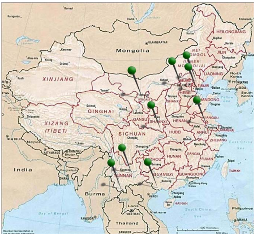
Figure 2 Geographical map of the Sino-German co-operative projects.