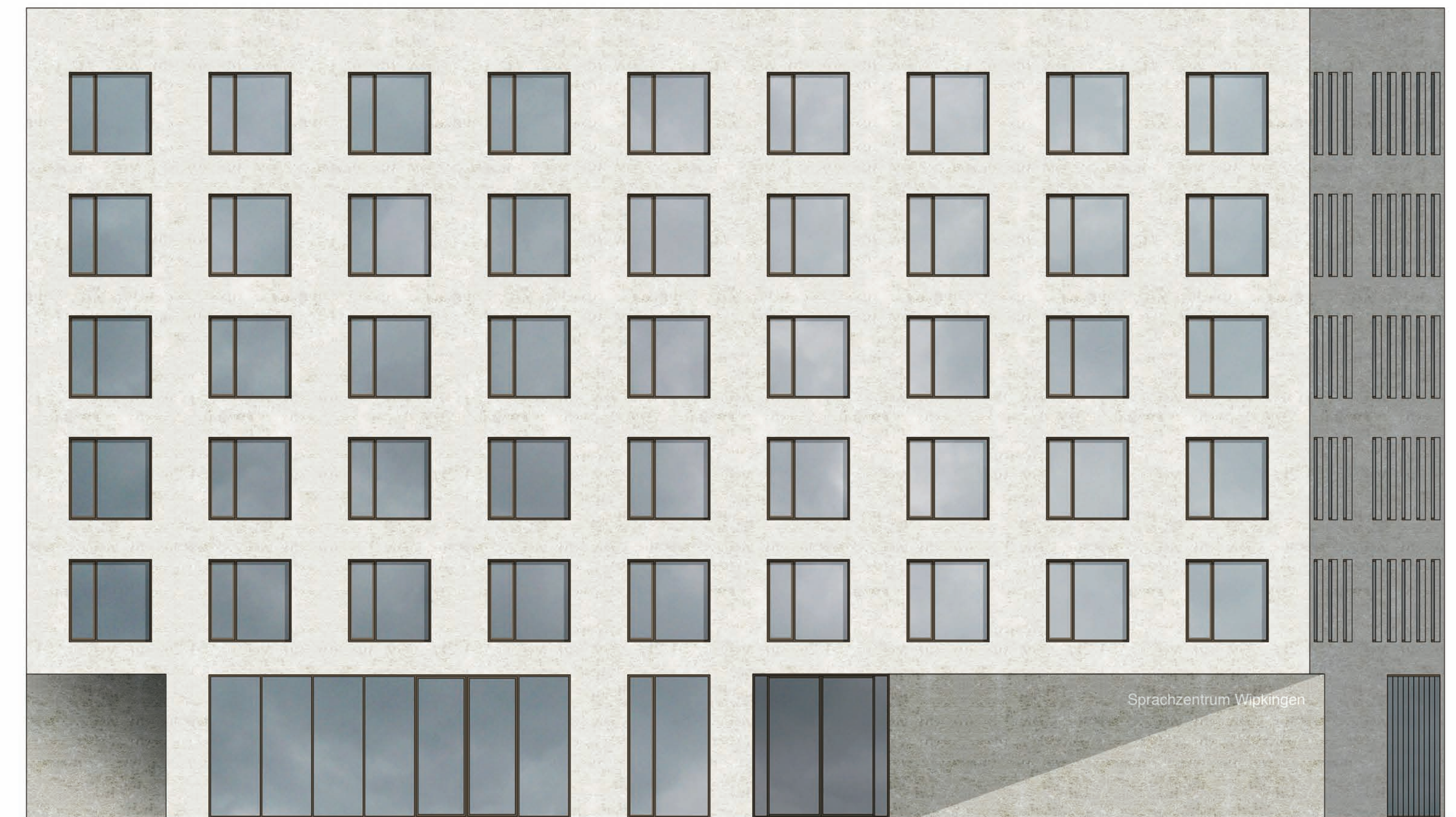
Ansicht Nord 1:100