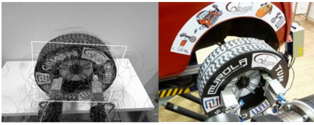
Fig. 2: Left: feature-based detection of the tire. Right: searching the axis of the car using admittance controller.