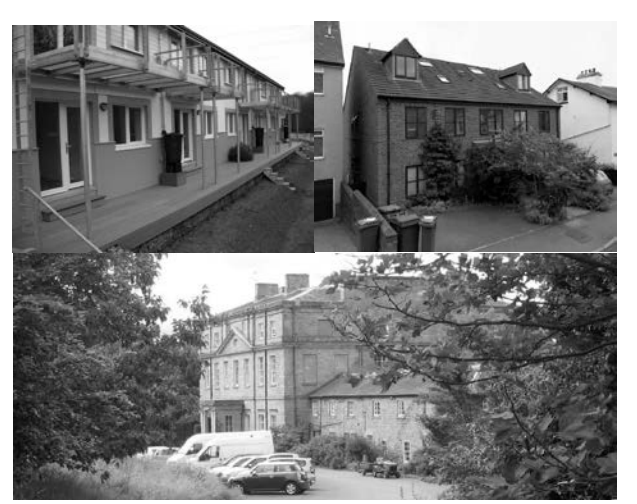
Figure 1: Lancaster, Shirebrook and Thundercliffe Grange Cohousing developments

The Lancaster Cohousing development took six years to recently complete using a participatory design process and a partnership contract between the design team, client and contractor. The homes have been bought by the residents individually on a long term leasehold arrangement with the freehold held by Lancaster Cohousing Company Ltd of which the residents are directors. Shirebrook Cohousing was designed by the original group members and initially funded by a housing association. The building is now jointly owned by the residents, not all of whom are original members. Thundercliffe Grange apartments are all leasehold with the freehold held by Thundercliffe Grange Ltd. of which the residents are directors. Virtually the entire building was renovated by the residents themselves in the 1970's (Figure 1).