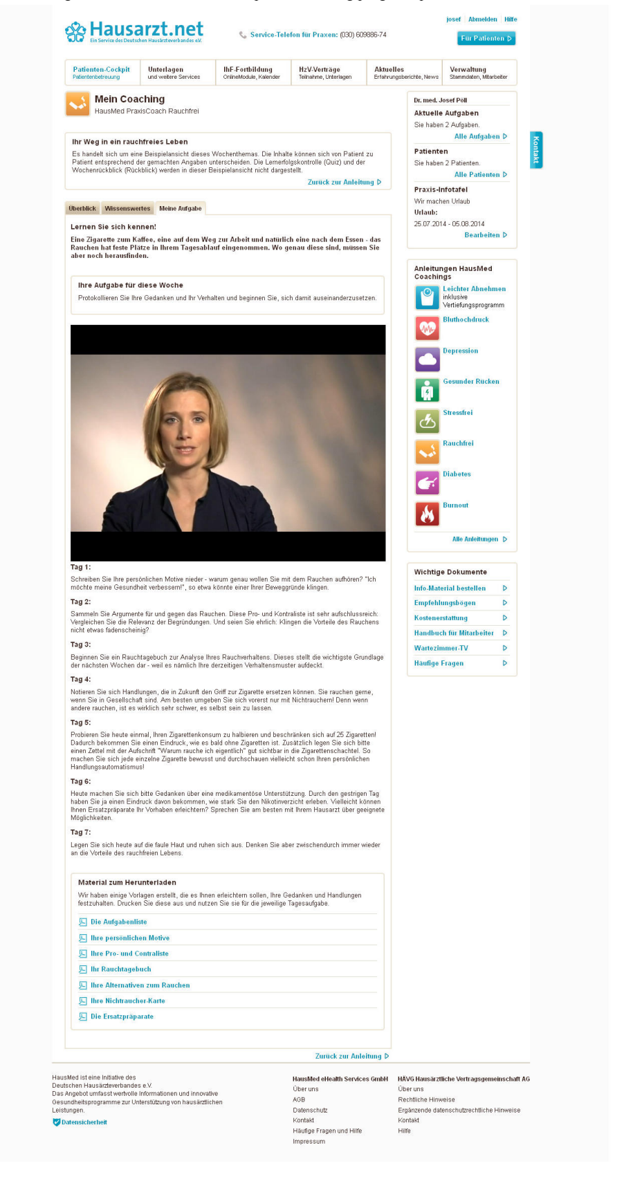
Figure 1. Specific daily tasks including interactive buttons, video clips, and learning progress quizzes.