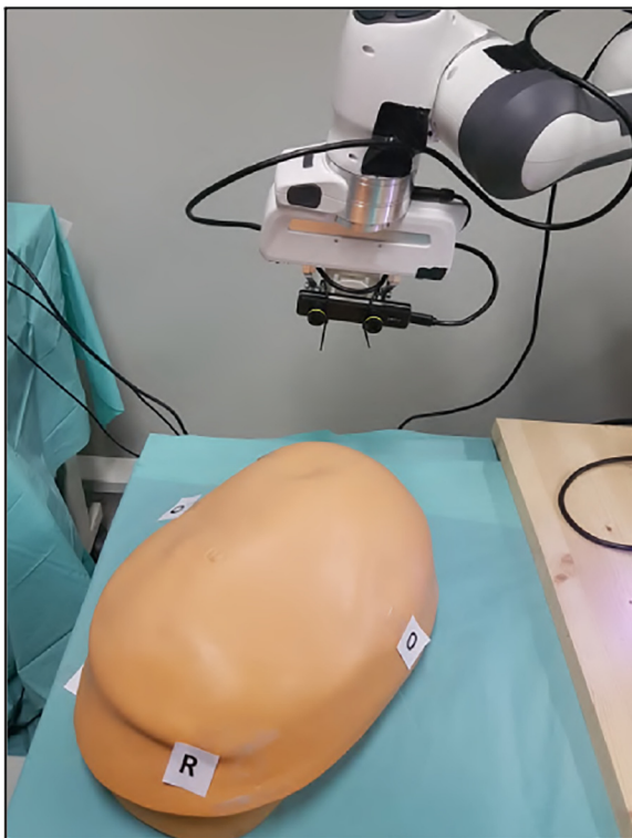
Figure 2: Setup of the pilot study on comparing EyeRobot with Keyboard/Mouse navigation of the robot arm. The goal is to navigate the camera such that each letter is well visible.

In this section, we evaluate the EyeRobot in the aspects of intuitiveness and the precision of control. We prepared an environment containing five printed letters as seen in Figure 2. The task of the participants is to position the camera, and with it, the robot arm, to face every letter sequentially in a timely manner. First, the participants use the HMD to control the EyeRobot and the second time with a keyboard and mouse. WASD controlled the translation based on the camera’s view direction, ‘Q’ and ‘E’ controlled up and down movement, and the mouse controlled pitch and yaw rotation. The time is measured for the entire procedure. We acquired