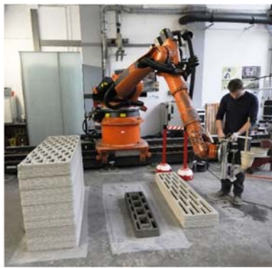
Figure 3. Additive manufacturing of wall elements by extrusion of wood concrete

In this subcategory of material extrusion, objects are built by depositing a paste material, typically in form of strands. After deposition the paste hardens by a physical or chemical mechanism. In clay extrusion, for example, the material hardens by the physical mechanism of drying. Cement on the other hand, solidifies by the chemical process of hydration. The use of wood can be achieved by adding wooden particles to a paste-like matrix. Different matrices like adhesives [19], methylcellulose [12] and fast-setting mineral binders [20] have been investigated. Also starch matrices were examined to develop wood-starch-composites suitable as feedstock for support structures in concrete extrusion [21].