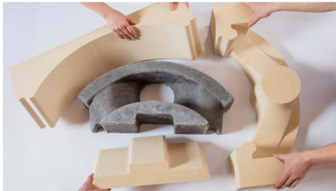
Figure 2. Concrete formwork manufactured by molten material extrusion from UPM Formi 3D material, consisting of cellulose fibers and PLA [17].

The feasibility of the use of wood in large scale additive manufacturing by molten material extrusion has been demonstrated in a small number of projects. Wood-composites containing 20 wt.% poplar fibers and 80 wt.% of PLA proved suitable to fabricate large-scale objects by molten material extrusion [15]. The feedstock in form of pellets was processed in a Big Area Additive Manufacturing (BAAM) system, which has a build volume of (L x W x H) 6 m x 2.5 m x 1.8 m, at the Manufacturing Demonstration Facility (MDF) of Oak Ridge National Laboratory, Tennessee, USA. The nozzle that was put to use had an orifice diameter of 7.62 mm, while the layer height was set to 5.84 mm. With this setup a full-scale podium