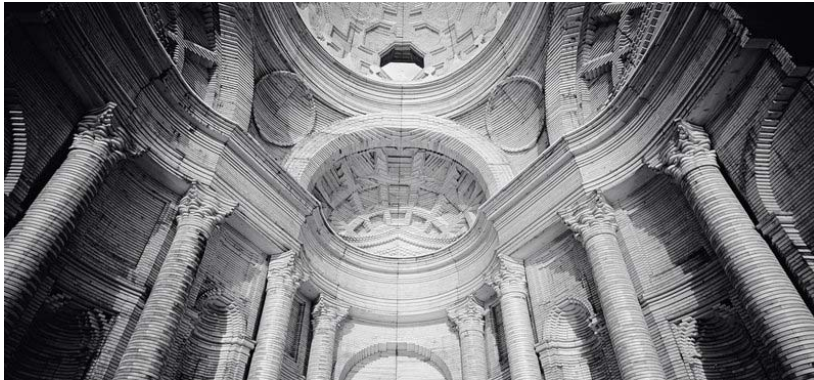
Figure 6. Real scale reconstruction of a baroque church, constructed by stacking CNC-cut layers of solid fir wood boards [28]

The use of wood in sheet lamination was already addressed in the patent “Laminated object manufacturing apparatus and method” filed 1995 by Helisys, Inc. [27]. In this case the feedstock may be veneer or plywood, where the degree of destruction of the naturally grown wood is comparatively low. That way, much of the original properties of the solid wood can be preserved. On the other hand, sheet lamination is always also characterized by the production of considerable amounts of waste, and the subtractively removed material cannot be directly returned to the process.