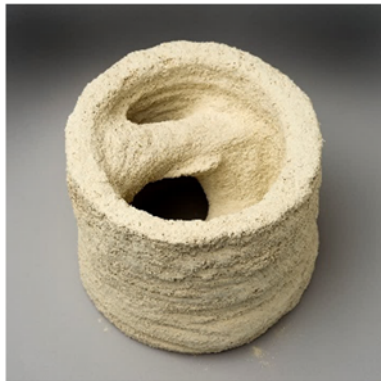
Figure 4. Tube with inner struts fabricated by selective binding of wood chips with cement

In binder jetting a fluid is applied locally to a volume of bulk material, to selectively bind the particles in those areas where the desired part is intended to be generated. The fluid can be a liquid binder. Alternatively, a dry component of the binder system can be added to the bulk as powder, which is then activated by the application of a fluid. In both cases these processes operate layer by layer. After finishing the last layer the unbound material is removed. Binder jetting is characterized by a high geometric freedom, as the unbound material acts as a support for overhanging or bridging regions of the parts. The process was developed as three-dimensional printing with the distinct goal of being able to use a wider variety of materials [23].