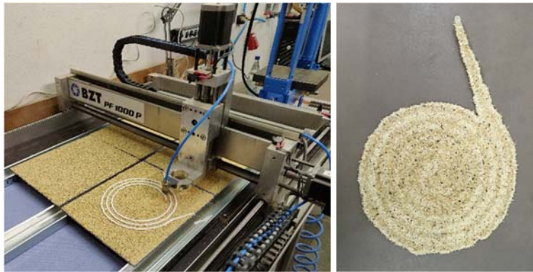
Figure 5. Individual layer fabrication: application of adhesive onto the layer of scattered wood chips (left) and individually contoured panel after pressing (right) (picture left D. Talke, right M. Anzinger)

Individual layer fabrication (ILF) has been devised explicitly for the manufacturing of large-scale wooden structures. In individual layer fabrication objects are built up by laminating individually contoured panels, but contrary to sheet lamination (see paragraph 2.5), the panels are not fabricated subtractively by cutting sheet material but additively by selective binding of wood particles. As each layer is fabricated individually, the process allows the application of mechanical pressure. Thereby, compared to other additive manufacturing techniques, the necessary amount of binder can be significantly reduced and mechanical properties comparable to particle boards can be achieved.